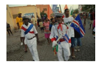
Figure 7: Tabanka