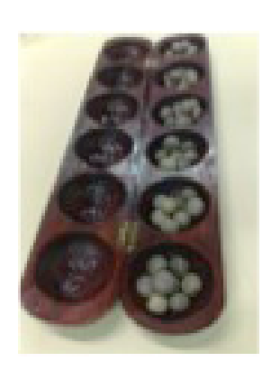
Figure 3: Batuque