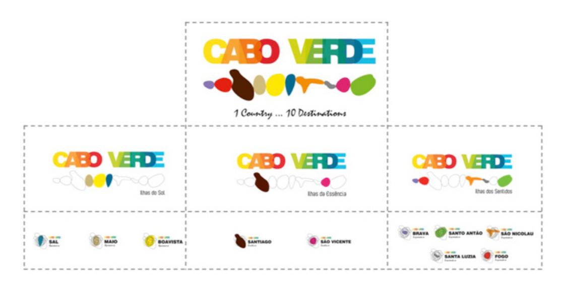
Figure 10: Brand Cape Verde and Island Groups

Nevertheless, in spite of this remarkable accomplishment, by excluding the country's cultural aspects and historical context, the selected logotype lacks authenticity and innovation. Further, in order to encapsulate to core essence of the Cape Verdean experience, the logo brand needed to include the greatness and wealth of the meaning and values of the archipelago: its characteristic, diversity, core personality, energy, magic, distinctiveness, and excitement. Therefore, on the grounds that a brand is used as a communication tool, cultural relations should play a critical role in divulging the richness (Anholt, 2003), and distinctiveness of the country. As an attempt to create a visual representation and an attractive image of the archipelago – a game of colors and the shapes of the ten islands that make up the archipelago – the selected design failed to capture the unique elements which differentiate the destination from competitors. Research has revealed that the similarities between the logo and the destination are an important determinant factor of enhancing brand recognition (Hem & Iversen, 2004).