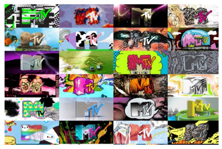
Figure 1: MTV Mutant Brands

The visual identity system used in commerce for economic purposes has also captured the attention of Destination Management Organizations (DMO) in the tourism industry. In 2009, as an attempt to diversify its tourism products and services, the city of Melbourne, Australia, contracted a brand consultant agency to replace the old and outdated brand, that was implemented in the 1990. Landor Associates, a brand design consultant agency, created the new flexible and future-focused corporate visual identity for the city of Melbourne, (see figure 2).