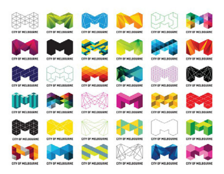
Figure 2: Melbourne Mutant Brands

Melbourne is a dynamic, progressive city, internationally known for its diversity, innovation, sustainability, and livability (Landor, 2010). Therefore, the city needed a brand to reflect its many identities and long-term sustainability, as well as its strategic plans for the future.