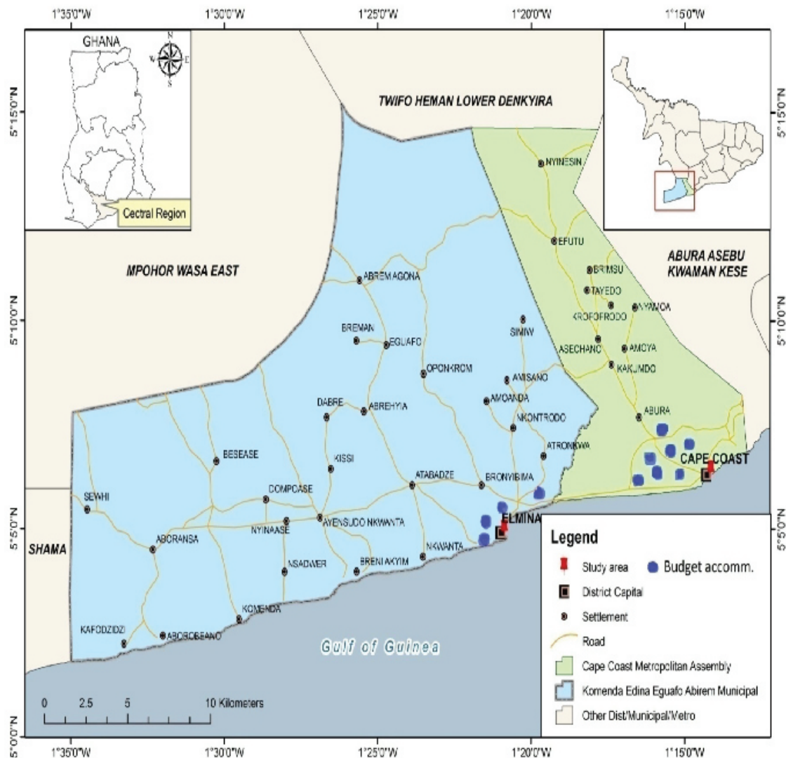
Figure 1: Map of Cape Coast-Elmina conurbation