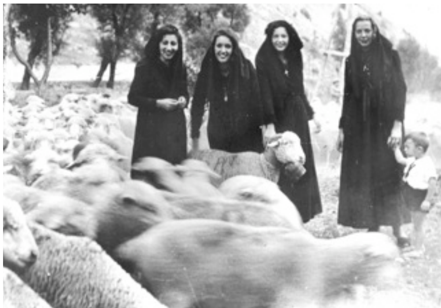
Picture 2. The wives welcome the shepherds, 1920