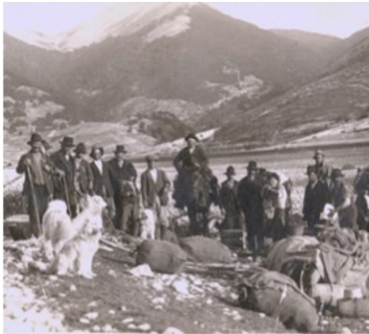
Picture 1. Group of shepherds during transhumance